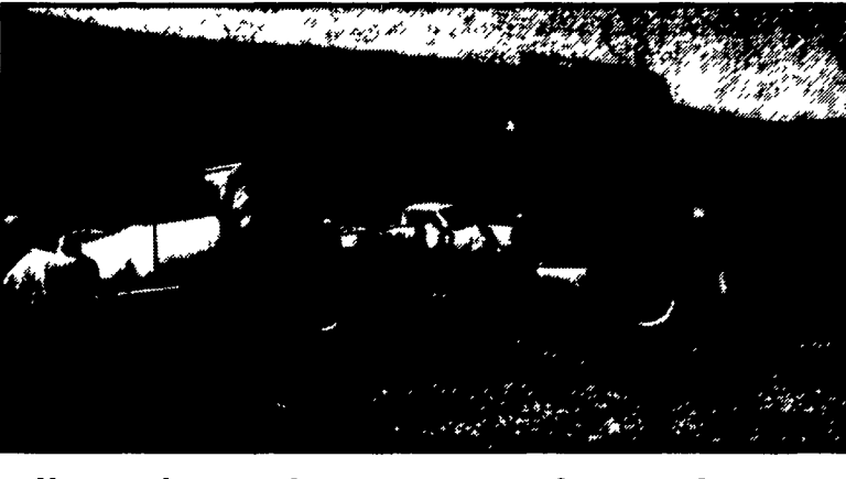
Hay equipment demos were one feature of a recent joint field day in Tloga County.

The Tioga County Farm Bureau summer picnic was also coincidentally set for the same day this year, so organizers decided to come on board with Kroeck and