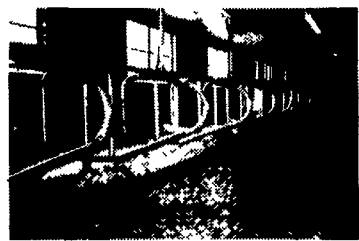
The Comfort Zone Tie Stall eliminates barriers to cow comfort.