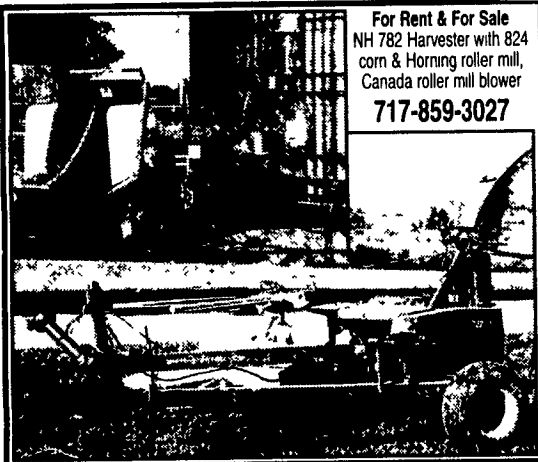
For Rent & For Sale NH 782 Harvester with 824 corn & Horning roller mill, Canada roller mill blower 717-859-3027

S & A Kreider & Sons 10ft Versa Bagger We setup & operate machine while bagging. Our service makes the difference. Call for scheduling & prices. 717-786-4427 or E-mail herbofarmer@cs.com