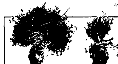
Traffic Tested™ Conventional

Best Roots and Crowns University of Minnesota testing over three years proves AmeriStand 403T averages 70% more root energy. Testing at four locations with three Universities shows this unique variety produces up to 16% thicker stands than conventional varieties.