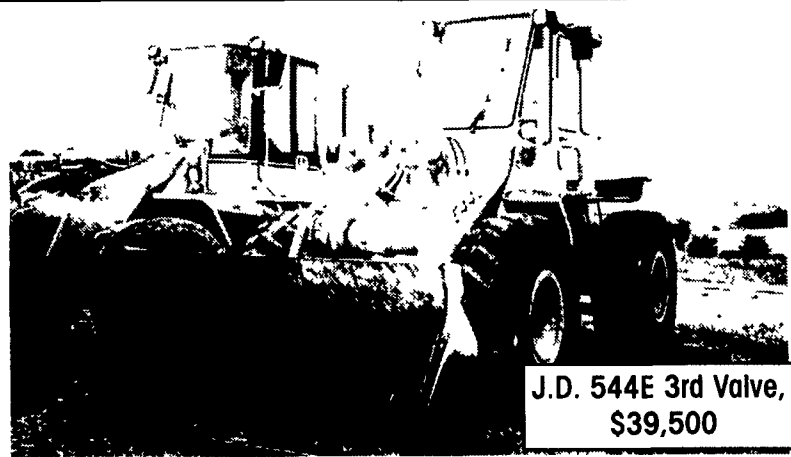
J.D. 544E 3rd Valve, $39,500