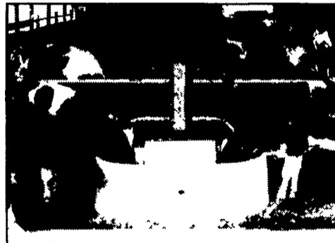
New Model #6100, BIGspring livestock waterer

The first waterers specifically designed for free stall installations