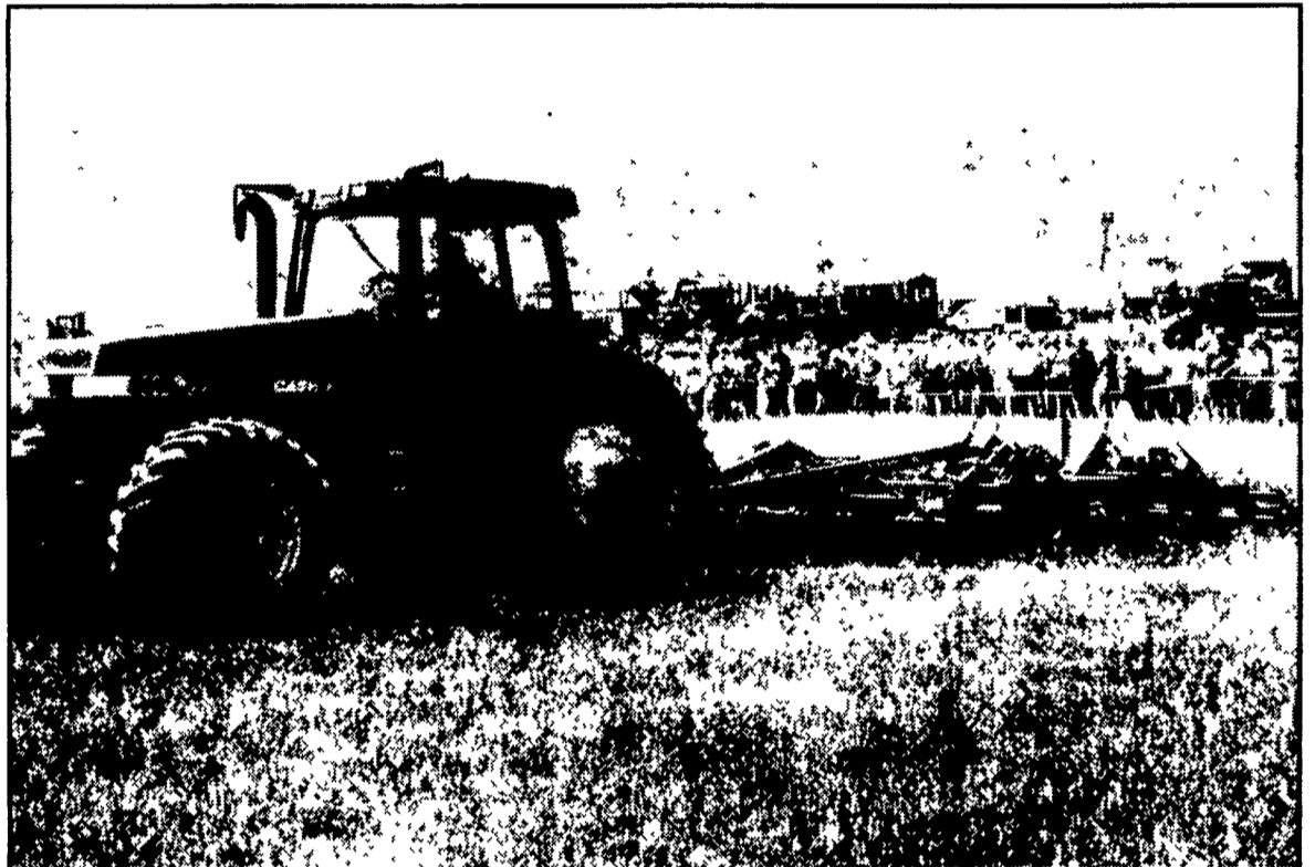
Tillage demonstrations drew crowds at last year's Ag Progress Days.

For more information on partners or activities in the Natural Resource Conservation Partnership Area, contact Stacy Mitchell, USDA Natural Resources Conservation Service, (717) 237-2208.