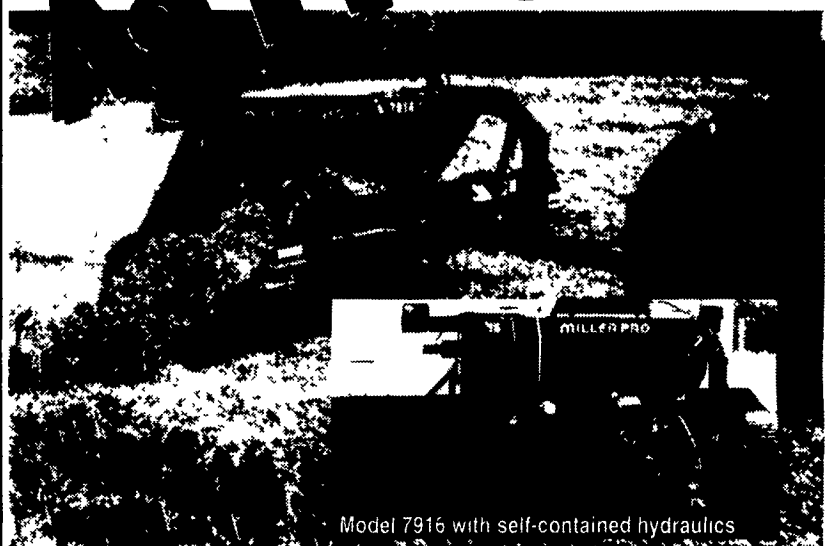
Model 7916 with self-contained hydraulics

Unique, patented ▲ Forward Flow™ design is especially effective for moving heavy, wet, downed crops.