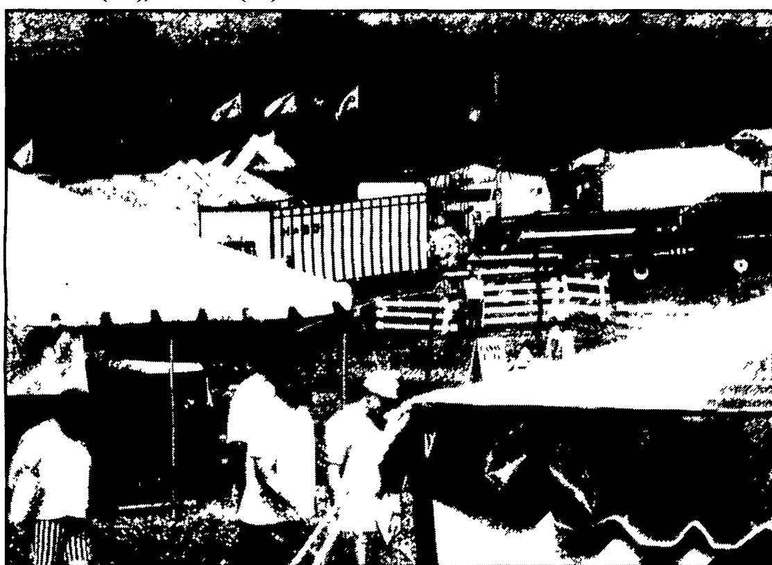
Thousands visit the Penn State Ag Progress site in Rockspring to see equipment demonstrations and learn the latest in farm life.

get your money's worth ★ www.millerprofarm.com