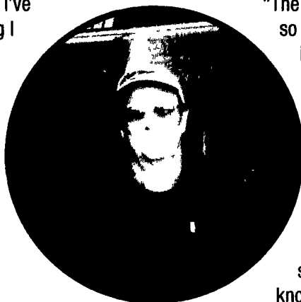
JOE MATEJIC Mechanicsville, PA

"I was amazed - it will take corn right out of the bin and plant at 98% accuracy going 6 MPH. The vacuum holds the seed against the plate and the seed only has to travel a matter of inches from the plate down the tube and into the ground."