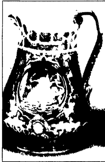
Wedgwood Majolica jug from England, c.1867.