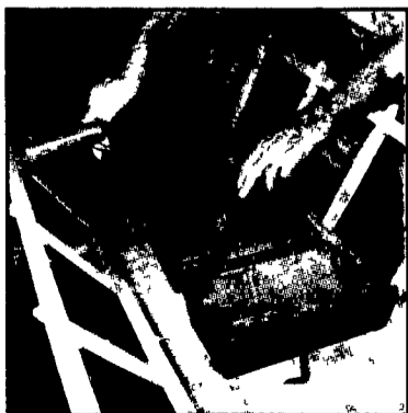
According to the Wilsons, this 1838 meat grinder is the same as that displayed in the Smithsonian Institute.

Different size plates are in place to use varying kernel sizes. The planter plowed a row, dropped a kernel, and rolled the soil over the kernel in one process.