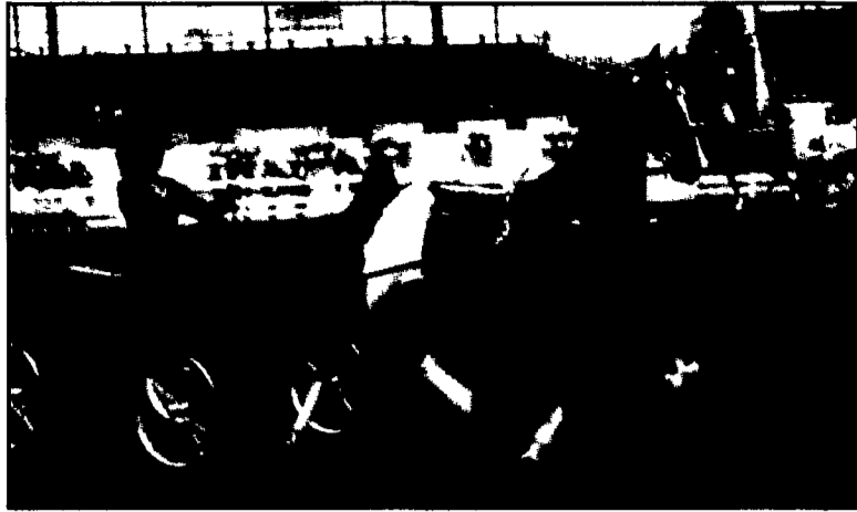
High-stepping Hackney ponies also competed during the event.

Conducted in the town of Devon, the event would not be complete without the fair adjacent to the Dixon Oval. The fair features rides, prizes, and food,