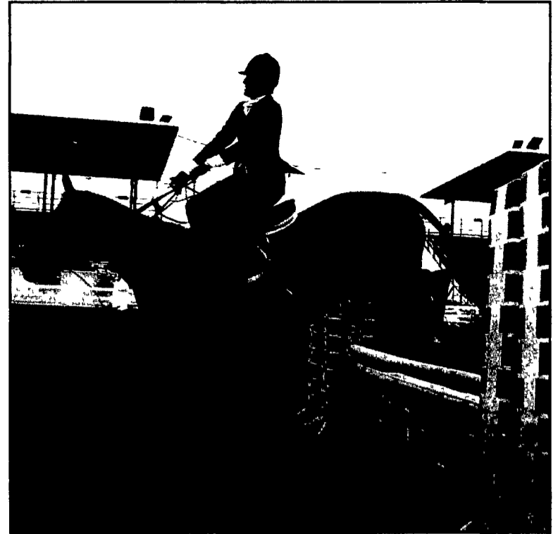
The event also included a ladies' side saddle over fences class.