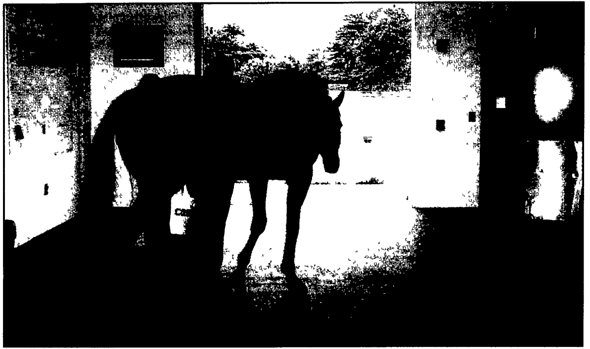
An equine patient heads out into the sunshine through the horse-sized door.

The facility also houses other important equipment for diagnosis of cardiovascular pathologies such as electrocar-