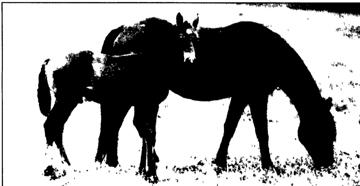
There are several issues for the mare owner to consider when evaluating which stallion is suitable, and what will produce that "perfect" foal.