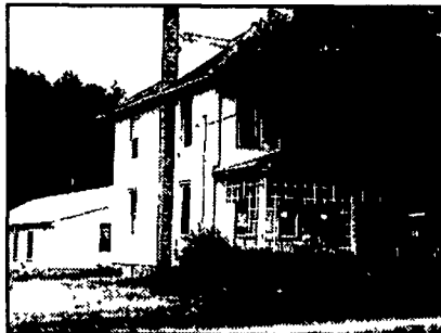
L Shaped Lot - .565 Acre M/L - Zoned Residential R2