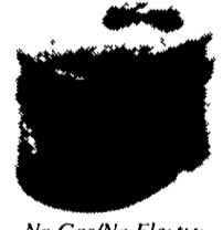
No Gas/No Electric MODEL 2008 8 Gallon