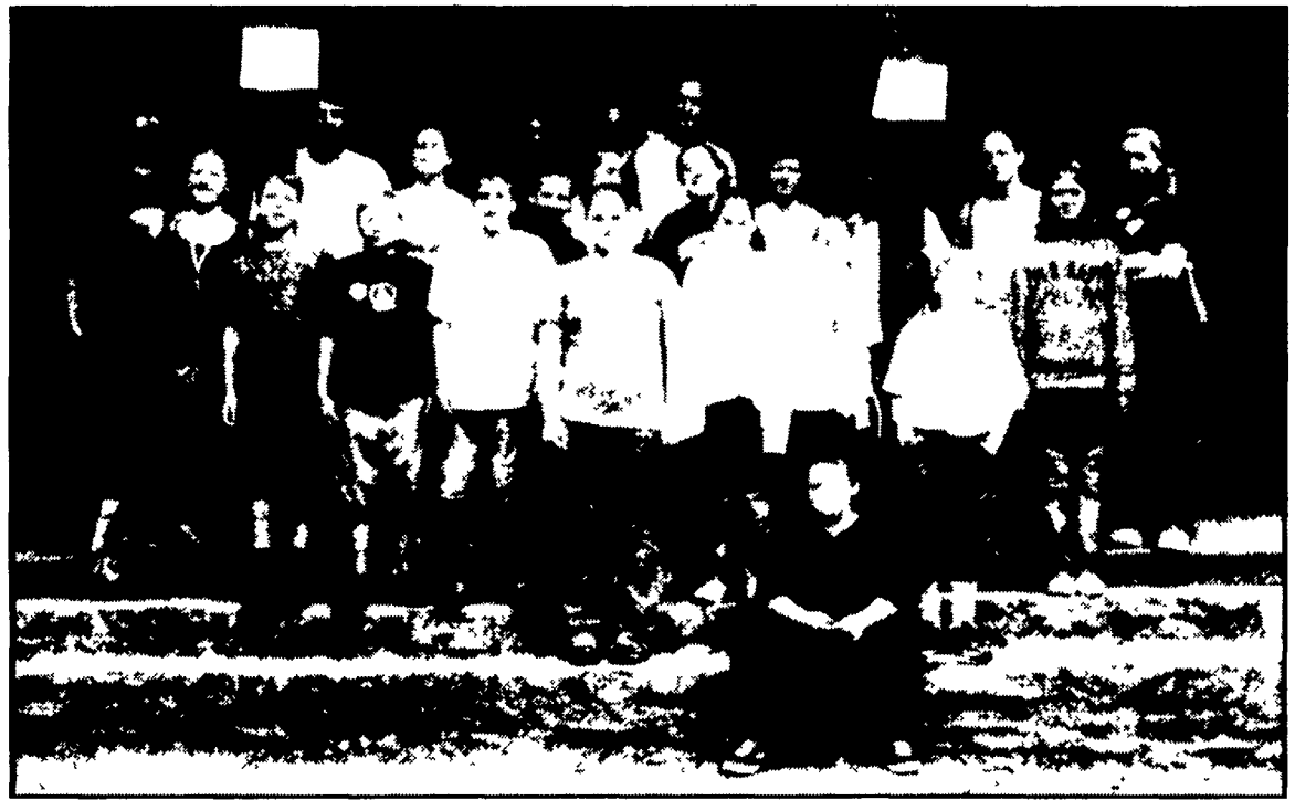
About 25 4-H members, four 4-H counselors, and three 4-H volunteers attended Camp Shehaqua in Hickory Run State Park July 7-11.

SHEHAQUA (Northampton Co.) morning workshops that campers shoot air rifles, or explore nature could a ose from include Le. napes: First Citizens; How Sweet 4-H'ers this summer was 4-H camp at Camp Shehaqua in the it is: Honey bees; What a Nui-Poconos. Each year, Northampsance: Wildlife; or The Big Drip: ton County 4-H members may Water. spend a week at Hickory Run During the afternoons, mem-State Park in the Poconos. The bers hiked to the lake, are chal-4-H camp is used by 30 county lenged by the low-ropes course, 4-H programs. play a sport, learn a line dance,