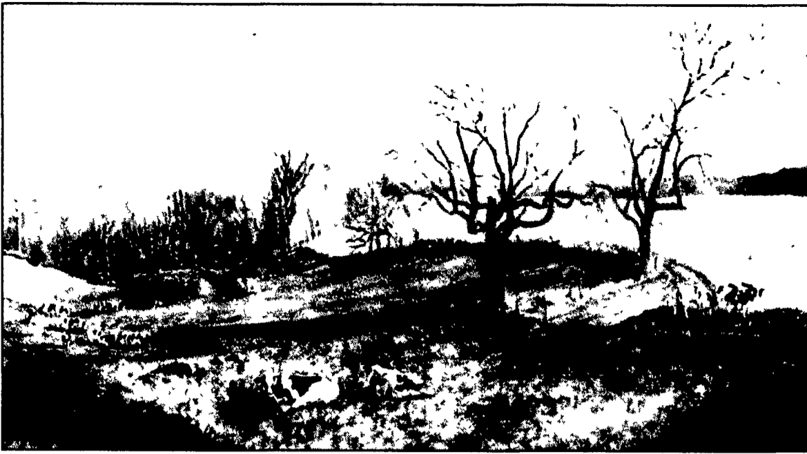
"Waiting for Spring" is captured in oils at the Miller and Davis Farm, Richmond Township.