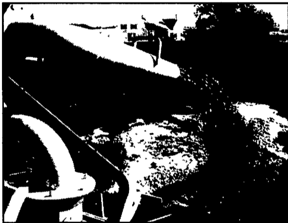
Deluxe Overtop Agitation capable of agitating formed crust