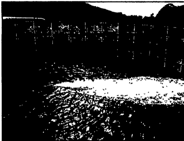
360-degree Floor Center Agitation