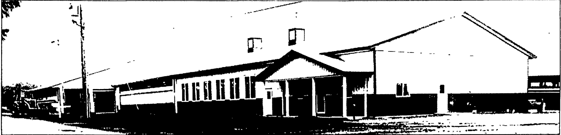
Designed and built by King Construction, New Holland, PA