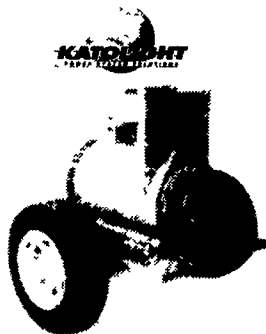
PTO Generators 25 to 135 KW Units In Stock!