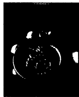
The first gold medals for the Chapter Golf Challenge were awarded at the tournament Monday evening.

1942 Camp Swatara Road • Myerstown, PA 17067 Ph: (717) 933-8853 • Fax: (717) 933-8078