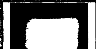
Round Concrete Watering Troughs, SCS Approved