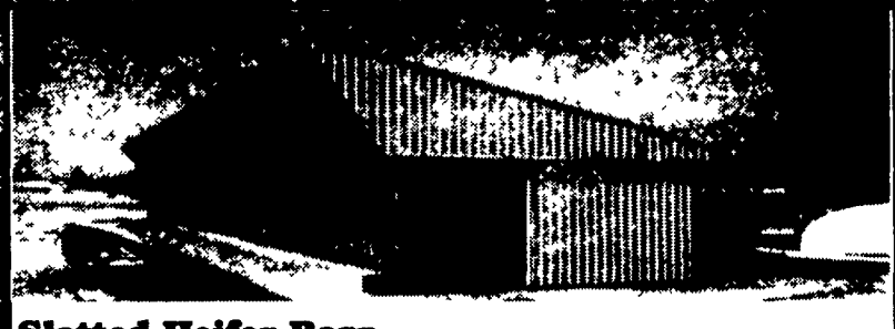
Slatted Heifer Barn