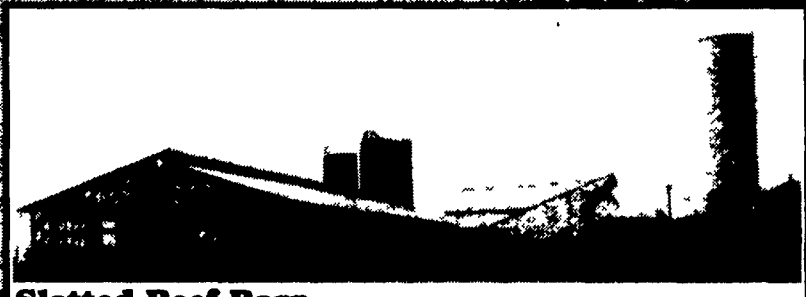
Slatted Beef Barn