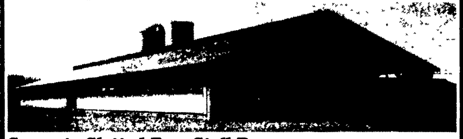
Concrete Slatted Free Stall Barn