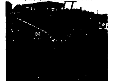
JUST ARRIVED Farmall 806 Diesel Wide Front