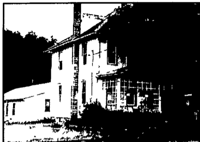
L Shaped Lot ~ $65 Acre M/L ~ Zoned Residential R2

Located at 503 Mt Sidney Rd., East Lampeter Twp., Lanc Co., Pa., in the Village of Witmer & directly across from the Conestoga Valley Middle School 2 1/2 story frame w/vinyl sided dwelling, slate roof, front porch w/alum roof, Eagle replacement windows throughout the dwelling, attached 3 car garage (1 double & 1 single overhead door w/elec door openers) 12'x20' workshop w/wood stove, storage area between house & garage w/ladder to storage area