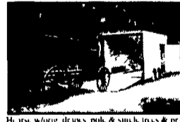
Horse wearing harness, pink & single traces & prof harness. Tamps 2002 Price America in enclosed trailer, custom built to transport horse. Selling in a catalogued session.