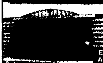
EXCELLENT FOR HAY AND GRAIN STORAGE

FAST AND SIMPLE TO ERECT!! NO CRANE NEEDED!!