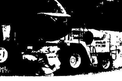
FX28, FX38, FX58 Switch From Hay to Corn Remove Crop Processor In Seconds With The Push Of A Button

Chop and process corn silage in one operation with New Holland's optional onboard CropPro™ crop processor.