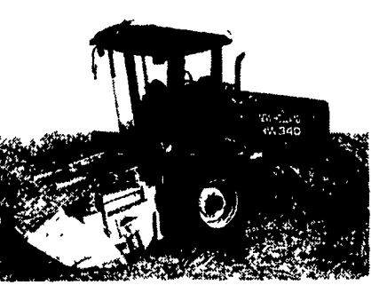
HW340 SP DISCBINE

14' - 18' Heads, 2-speed Hydrostatic 6 cylinder Turbo