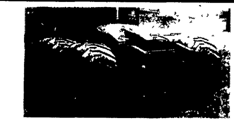
Flotation Tires Budd And Spoke Application

Chambersburg, PA 814-629-7338 800-640-4448 Pickup & Delivery