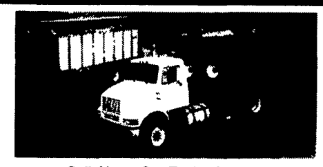
Call About Our Trailer System: 26' Forage Box, 6300 Gal. Tanker