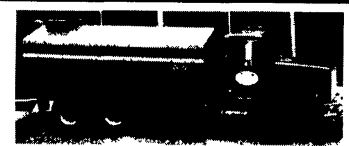
Generation II Custom Truck Tanker