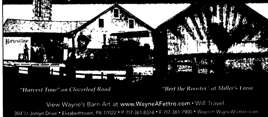
"Harvest Time" on Cloverleaf Road