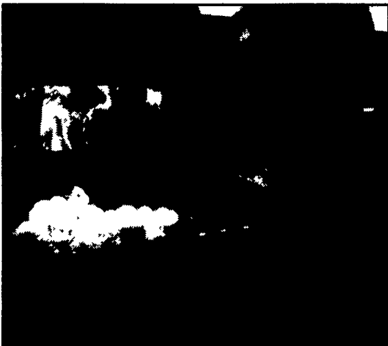
The chick-hatching display was educational for children such as Garrett Graupensperger, 4, Landisville.