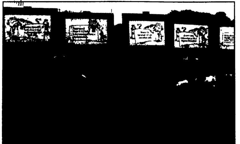
A scavenger hunt had young participants talking to vendors and reading educational posters such as these.