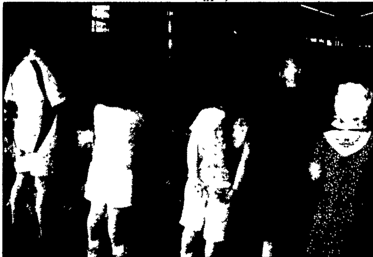
Visitors had a chance to watch the herd being milked from 10 a.m. to 3 p.m. each day.