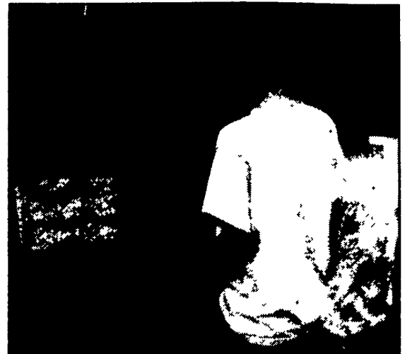
Andrew 9, and Micah Roth, 7, Lititz, learn about a cow's daily water consumption, part of the educational displays for the public to read.