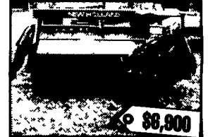
C 44395 NH 411 Disc Mower Conditioner, 9' Cut, 540 PTO, New Rubber Rolls, New Bearings & Drive Shaft