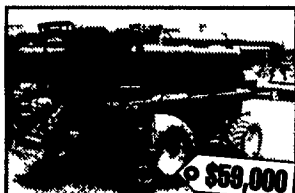
B 44554 1993 CIH 1688 4WD, 2250 Hrs, Rotor, Rock Trap, Chopper, Tires Drive-30.5x32, Steer-18.4x26, Field Tracker, 2 Sp Hydro