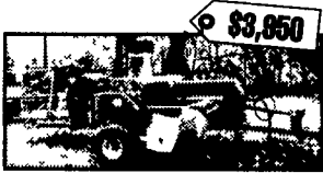
C 32339 JD 336 Baler, W/#40 Thrower, Mechanical Pickup, Auger Feed, 540 RPM PTO, Manual Tongue, 4-Ball Twine Capacity, Tires 11Lx14, 26x12, Gandy Granular Preservative