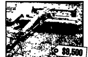
B 44888 CIH 8312 Mower Conditioner