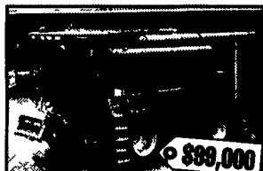
B 42763 1998 CIH 2388 2WD, 1114 Hours, Specialty Rotor, Rock Trap, Field Tracker, 2 Sp Hydro, 208" Unloading Auger

Financing Until Jan. 1, 2004 on Used Combines!*