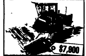
A 24794 New Holland 1495 Windrower, 12' Cut, 13.5x16 1 SL Tires, Rubber Rolls