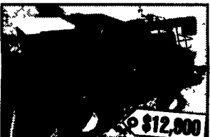
A 25150 1978 IH 1460, 4000 Hrs, Tires: 28Lx26 Drive, 18.4x16.1 Steer, Chaff Spreader, Very Good Condition