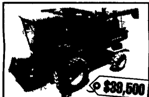
A 25521 1989 CIH 1680, 3047 Hrs, Diesel, Spec Rotor, Rock Trap, Chopper, Rebuilt Hydro Units, Field Tracker, Complete Uptime Done 10/02