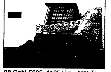
98 Gehl 5635, 1105 Hrs., 40% Tires $11,500

01 Cat 246, Cab w/Heat, 1100 Hrs, New Tires, w/Forks CALL Ford 6610, w/Side Mount Mower, Canopy CALL New Pallet Forks . . . . . $495 72" Root Grapples $2,200