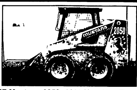
97 Mustang 2050, 1000 Hrs., New Tires $9,500

JD 4840 20.8x38 radials . . . . $14,600 IH 1586 w/15' bat wing mower IH 1486 cab dual PTO & Remotes IH 1486 cab, 18.4x38 tires . . . . $7,800 IH 656, dsl, hydro, w/2250 ldr . . $6,200 Case 2590 cab . . . . . $8,600 MF 285, 82 hp diesel Closed June 18 to July 4 MADEY FARMS (814) 467-8839