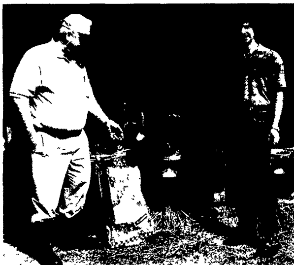
Startena gets calves off to a good start on Woodedge Farm.

He tried to remedy the problem by switching to a new feed company to provide better energy supplements. But nine months later, the herd's reproductive performance was still poor.