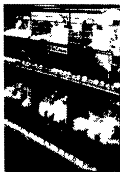
Eurovent EU The manure belt battery for layers that can be upgraded

Let us show you how remodeling will increase your production.