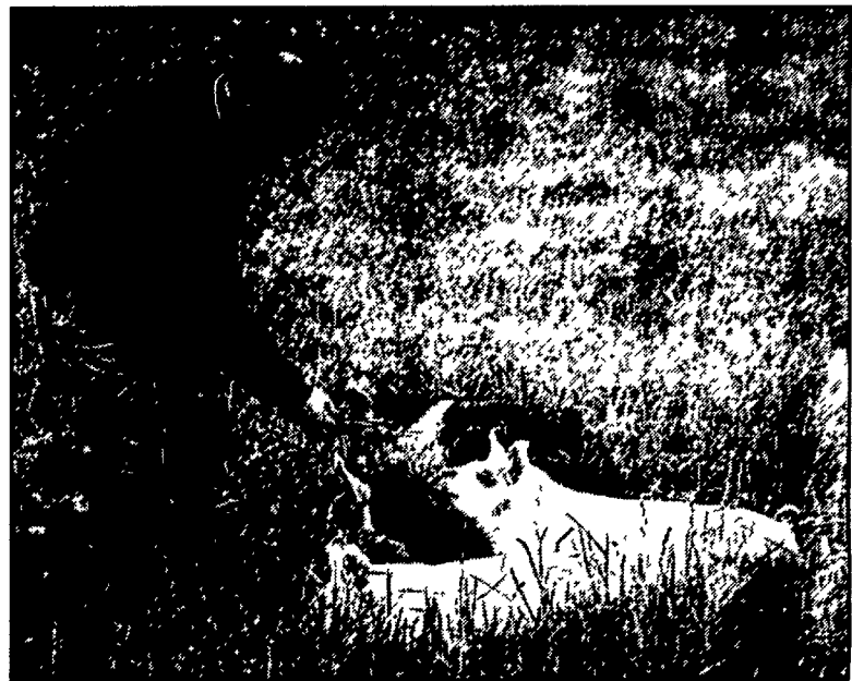
The folks at Milky Way Farm are always looking for new ways to serve their customers. Here Kim Seeley shows their latest enterprise — pastured pork production.