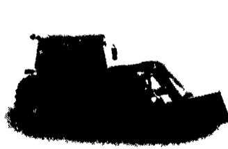
Grand L30 Series Compact Tractor Brains and Brawn from 24 to 44 PTO HP