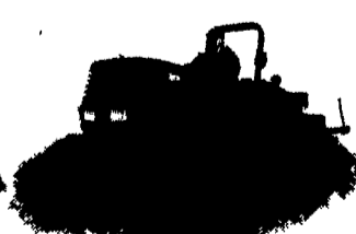
M Series Tractor 43 to 98 PTO HP, versatile, dependable, easy to use