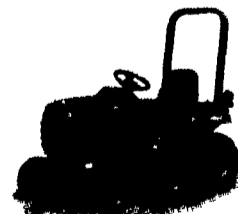
BX Sub-compact Tractor 15 to 22 HP liquid cooled diesel engine