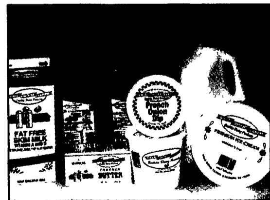
Vale Wood Farms offers a wide range of products.