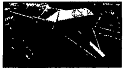
A 22975 Reynolds RE-30, Rear Ejector Wagon, 30 Ton, Loads 22 Cu Yds of Mud, Soil, Rock, or Demo Mat.

B 25697 Miskin Sp-C17 17 Yd Dump Style Scraper, Ejector Style