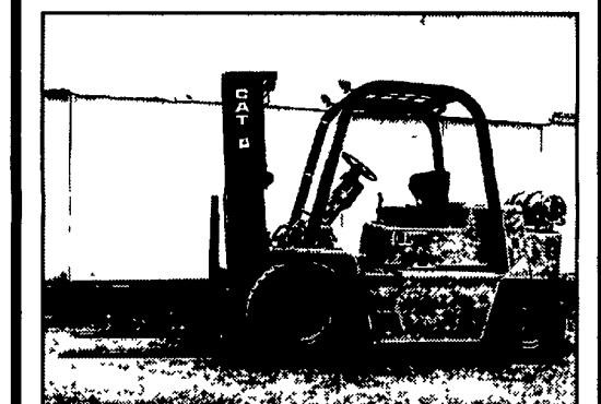
1990 Cat, 8,000 lb., 3 stage mast, side shifter, LP Gas