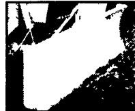
B 43831 Grouser 12' Blade