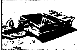
B 25346 Reynolds 14c-Cs 14 Yard Scraper, Dump Style, Full Hydraulics, Warranty