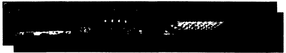
Hetrickdale Farms - Complete Dairy Complex - 1,200 Cow Unit - Bernville, PA

We at TRIPLE H Construction believe our experience with agricultural projects ensures our fulfillment of your needs. In an agricultural application, we are the one company you can absolutely trust to handle every step of construction.