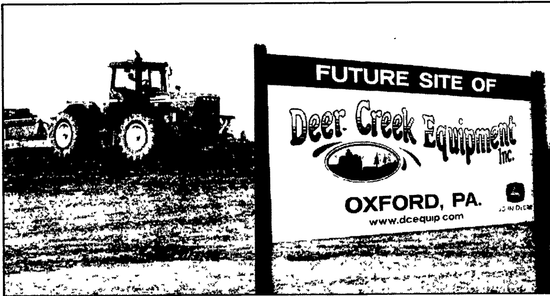
Deer Creek Equipment broke ground for its brand new facility at 150 Whiteside Road in April 2003. The new facility will provide 31,500 square feet of space and provide a more spacious and up to date retail atmosphere as well as state of the art repair facilities.

The new building will make it even more convenient for customers to do business with Deer Creek. Construction is expected to be finished by November 2003.