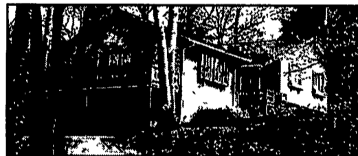
3/4 ACRE M/L WOODED LOT, DEAD-END STREET

Located at 132 Maple Dr., New Holland, Earl Twp., Lanc. Co., PA. Two miles south of New Holland, turn off Rt. 23 in New Holland on Brimmer Ave. Turn right on Maple Dr. to sale, dead-end street, Garden Spot School District.