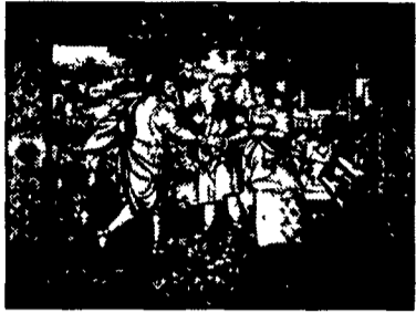
Flowering Lady by Renoir.

Many such prints have been made over the years. The frame may be worth more than the print which could sell at a garage sale for $10.