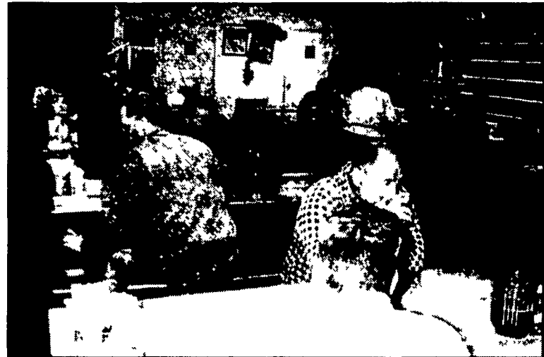
Customers eat inside the Road Kill Cafe.