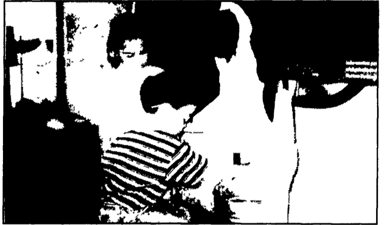
Children visiting the Maryland Ag Showcase try their hand at milking a cow when the Showcase visited the Maryland Sheep & Wool Festival recently.