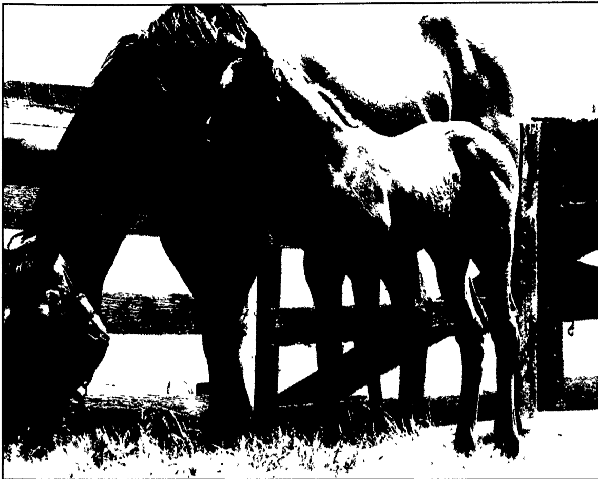
This picture, taken in May 2002, shows Hold To Fashion and her filly, a daughter of Forest Wildcat.

A horse qualifies to be in the Kentucky Derby by the amount of money winnings, "which is why they (owners and trainers) want to win the prep races," he said. Only the top 18 or so colts or fillies run in the Derby.