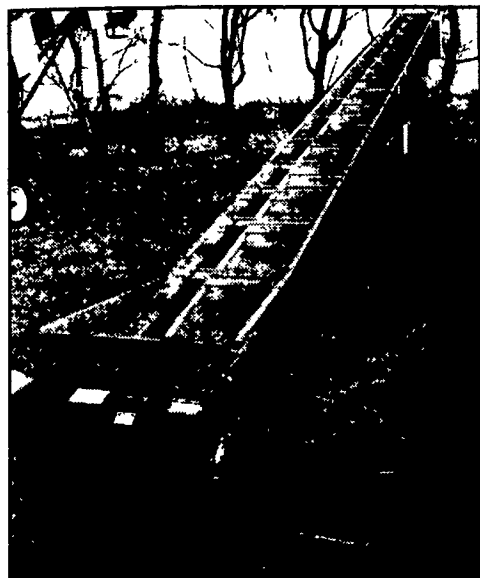
Hay & Corn Elevator with Heavy Duty Chain and Sturdy Paddles

Well Balanced, Ruggedly Built For Many Years Of Trouble Free Service