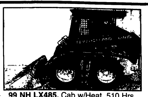
99 NH LX485, Cab w/Heat, 510 Hrs., Tracks, Tooth Bar $11,900