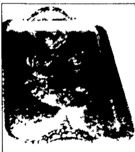
Rodney Kent Tray

A good starting price would be $2,000 or best offer. Run an ad in your