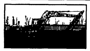
1984 John Deere 690B, 36" bucket, standard stick, joystick controls, v.g undercarriage & condition, work ready, $19,000