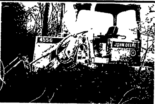
455G Series IV John Deere Crawler Loader Diesel w/ 1050 hrs. Light service work, Excellent Condition, asking $45,000. 484/614-5141