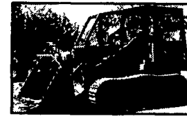
1988 Case 1155E, OROPS/sweeps, 4 in 1 bucket w/teeth, v.g undercarriage & condition, work ready $23,000