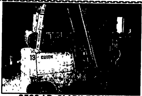
3500 LB. CLARK FORKLIFT WITH SIDE SHIFT

500 gal spray tank, 3 pt quick-connect, swivel rear tires w/tow hitch on rear, $650/obo. 410-749-8994