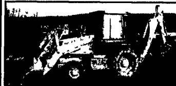
1998 Case 580L, cab, 4WD, standard hoe, aux hyd., 24" bucket, v.g cond. $28,500