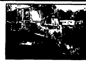
1995 Cat 311, 24" bucket, standard stick, v.g undercarriage, fresh paint, work ready, $29,500