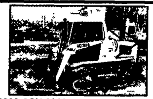
1999 ASV 2810, gp bucket, auxiliary hydraulics, 24" tracks, v.g condition 790 hours, work ready $21,500