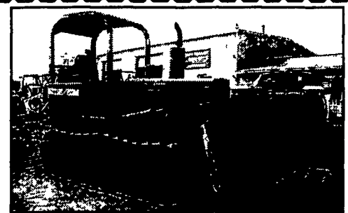
DRESSER TD8G DOZER ..... $20,000

4 Cyl., 12 Volt, LP, System Works and Runs Great, 100%. Must Sell. $3,000 OBO 717-629-4825