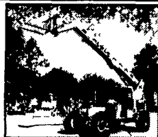
Telescopic Forklifts, Gehl, JCB, Lull, Terex, 5,000-8,000 lbs, from $16,500