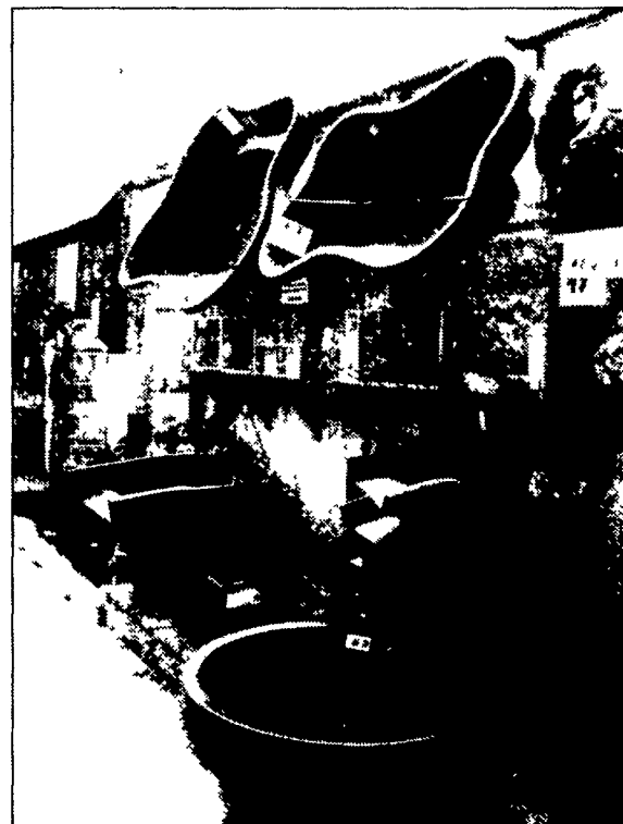
Liners have gotten not only bigger but also more heavy duty over the years. In addition to liners, preform ponds are available.